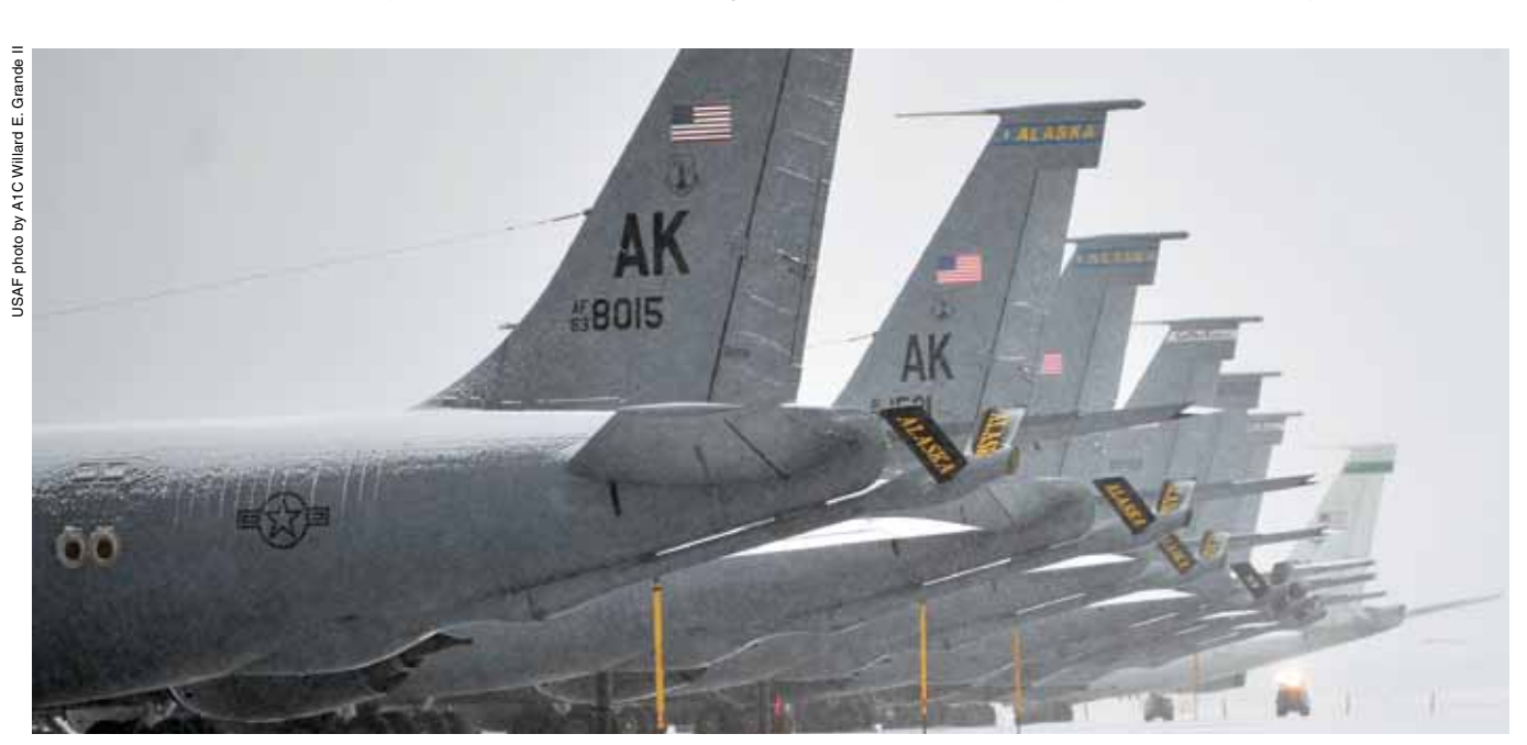
KC-135 tankers from Alaska and Grand Forks AFB, N.D., line up at Eielson AFB, Alaska, during a winter storm.

Yokota AB, Japan, APO AP 96328-5000; approx. 28 mi. W of downtown Tokyo. Phone: (cmcl, from CONUS) 011-81-311-755-1110; DSN 315-225-1110. Majcom: PACAF. Host: 374th AW. Mission: C-12J, C-130H, and UH-1N operations. Primary airlift hub for the Western Pacific. Major tenants: US Forces Japan; 5th Air Force (PACAF); 515th AMOG (AMC); 730th AMS (AMC); Det. 1, Air Force Band of the Pacific-Asia; American Forces Network-Tokyo; DFAS-Japan. History: opened as Tama AAF by the Japanese in 1939. Area: 1,750 acres. Runway: 11,000 ft. Altitude: 457 ft. Personnel: permanent party military, 3,414; DOD civilians, 199. Housing: single family, officer, 683, enlisted, 1,080; unaccompanied, UOQ, 184, UAQ/UEQ, 896; visiting quarters 182; TLF, 189. Hospital.